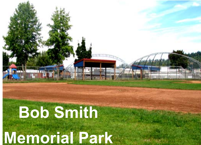
Bob Smith Memorial Park