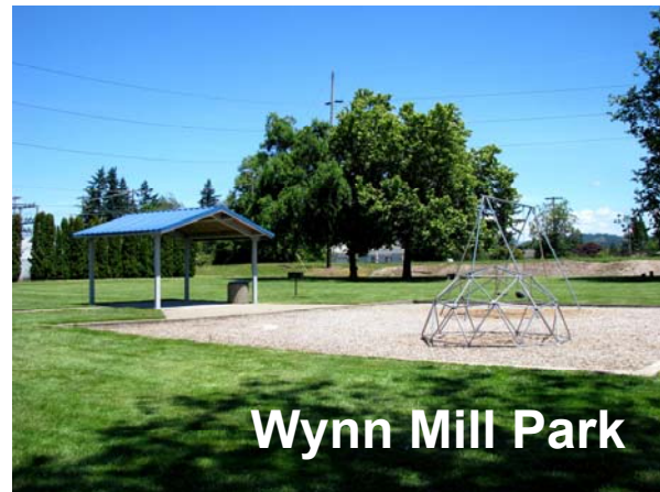
Wynn Mill Park